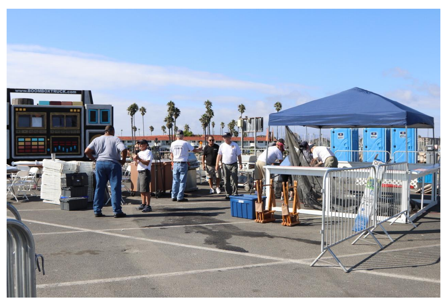
A few pictures from Harbor Days September 16 & 17 and the set up on the 15.